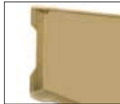
Solid AF and ATT