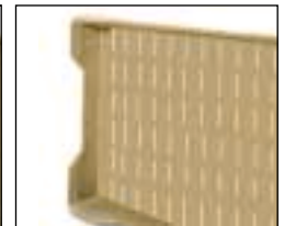
Slotted Pattern VAF