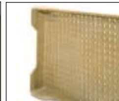
Hole Pattern VAF