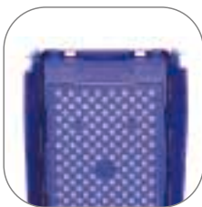
Plus-Grid™ Bottom (Textured)