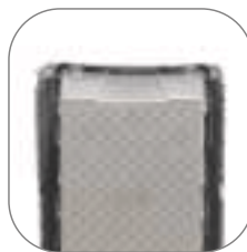
Drain Hole Bottom (Textured)

Three container bottom styles are available for a variety of automated and conveying systems in today's high-speed distribution operations.