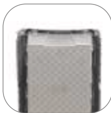
Solid Bottom (Textured)

tdb = Products are not trialed in ESD protective materials. ORBIS will only quote these products after successful completion of a trial. Minimum order requirements apply.