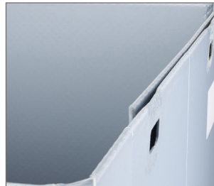
Reinforcing double wall design to enhance strength