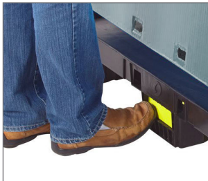
Active latch allows sleeve to easily engage and disengage from the pallet