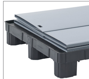
When collapsed, sleeves fit inside the pallet for improved return efficiency