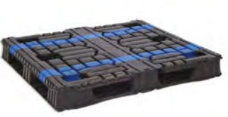
44" x 52" | BREAD PALLET L 43.3 x W 51.8 x H 6.6 38.0 lbs - 416 Max TL