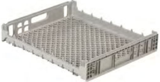
26" x 22" | DOUBLE LAYER BUN BASKET OD 25.9 x 21.8 x 4.1 ID 24.8 x 20.8 x 4.1 3.1 lbs - 4,368 Max TL NPL 630