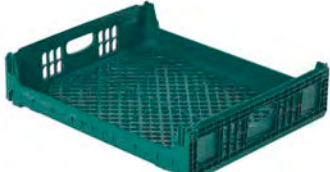
27" x 22" | BREAD BASKET OD 26.5 x 22.0 x 6.0 ID 25.3 x 21.3 x 6.0 4.0 lbs - 3,082 Max TL NPL 650