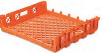
26" x 22" | SINGLE SINGLE LAYER BUN BASKET OD 25.5 x 22.0 x 5.9 ID 23.8 x 21.0 x 5.9 3.0 lbs - 4,224 Max TL BB255W