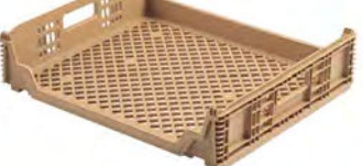
26" x 22" | BREAD BASKET OD 26.7 x 22.3 x 6.0 ID 25.5 x 21.1 x 6.0 4.0 lbs - 2,700 Max TL BT2622-50