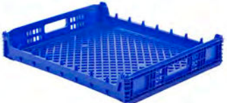
26" x 22" | DOUBLE LAYER BUN BASKET OD 26.0 x 21.8 x 4.8 ID 24.9 x 20.8 x 4.8 3.3 lbs - 4,368 Max TL BT2622-37