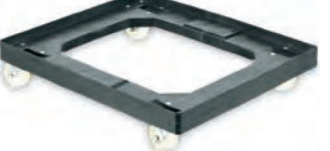
26" x 22" | DOLLY OD 26.6 x 22.5 ID 26.4 x 22.2 9.1 lbs - 1,584 Max TL NPL 700