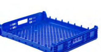
27" x 22" | DOUBLE LAYER BUN BASKET OD 26.7 x 22.3 x 5.0 ID 25.5 x 21.1 x 5.0 3.6 lbs - 3,726 Max TL BT2722-37