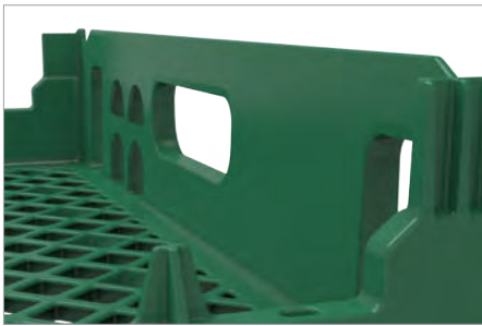
SYSTEM EFFICIENCY Bun trays that can integrate with automated systems, and offer smooth surfaces and contoured corners for product protection.