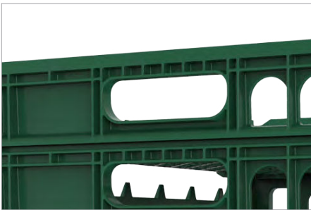
COMFORT GRIP OPEN HANDLES Reduce worker strain with contoured corners and surfaces.