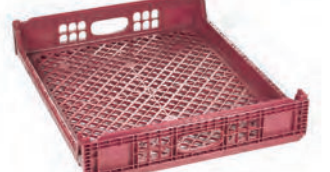
27" x 22" | DOUBLE LAYER BUN BASKET OD 26.5 x 22.0 x 5.0 ID 25.4 x 21.0 x 5.0 3.9 lbs - 3,726 Max TL NPL 649