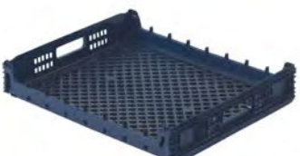
27" x 22" | SINGLE LAYER BUN BASKET OD 26.7 x 22.3 x 3.8 ID 25.5 x 21.1 x 3.8 3.3 lbs - 5,037 Max TL BT2722-27