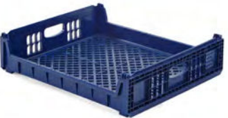
26" x 22" | BREAD BASKET OD 25.9 x 21.8 x 5.9 ID 24.5 x 20.8 x 5.9 3.6 lbs - 3,168 Max TL NPL 640