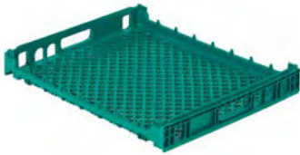
26" x 22" | SINGLE LAYER BUN BASKET OD 25.9 x 21.8 x 3.5 ID 24.8 x 20.8 x 3.5 3.0 lbs - 6,192 Max TL NPL 620