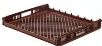
26" x 22" | SINGLE LAYER BUN BASKET OD 26.0 x 21.8 x 3.6 ID 24.9 x 20.8 x 3.6 2.8 lbs - 5,952 Max TL BT2622-27