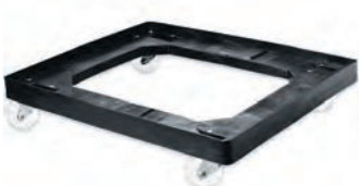
27" x 22" | DOLLY OD 27.5 x 22.5 ID 26.4 x 22.2 9.1 lbs - 1,584 Max TL NPL 701