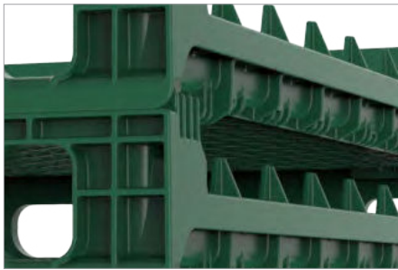
SPACE SAVINGS When full, baskets stack securely for easy transport and merchandising. When empty, they cross-stack and nest for back room and truck space savings.