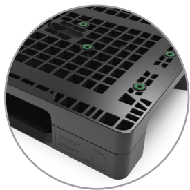
Minimize load shifting with optional molded-in frictional elements*