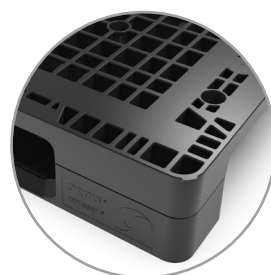
Keep plants and equipment clean with hygienic design options