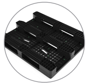
Seamless conveyance with 3-runner bottom; full picture frame bottom available